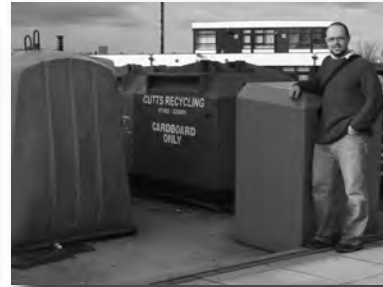
More recycling banks are needed

We believe that traffic reduction is the only long term solution to jams, air pollution and road danger. We have fought to keep local services, such as schools and post offices, that reduce our need to travel. Greens have also campaigned to re-introduce bus regulation, re-open railway stations at Heeley and Millhouses and install more pedestrian crossings and cycle routes.